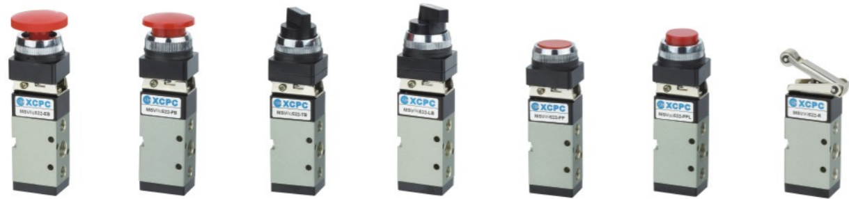
MSV86522-EB MSV86522-PB MSV86522-TB MSV86522-LB MSV86522-PP MSV86522-PPL MSV86522-R