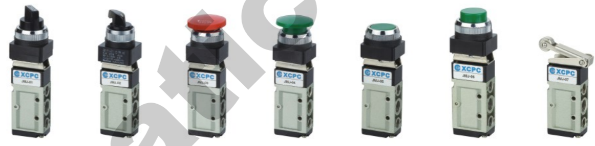
JMJ-01 MJMJ-02 MJMJ-03 MJMJ-04 MJMJ-05 MJMJ-06 MJMJ-07